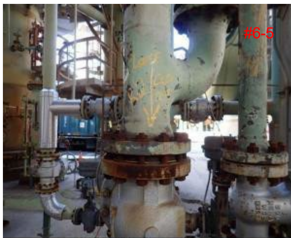
Bolting Hardware Loose