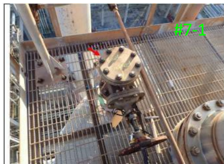
T-7461-4" Vent Overview