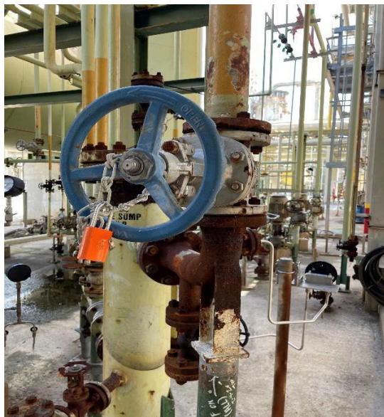
F-7453 Outlet - #6-10