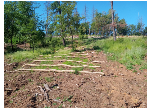
The Middletown Rancheria is using EPA funding to install straw waddles to help minimize erosion and to reduce sediment levels in stormwater runoff entering the Saint Helena Creek.