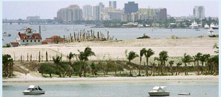
Coastal cities like West Palm Beach will likely need to take adaptive measures, such as building larger seawalls, elevating structures, and nourishing beaches, to avoid damage from sea level rise.

Along the Atlantic and Gulf Coasts of Florida, the land surface is also sinking. If the oceans and atmosphere continue to warm, sea level along the Florida coast is likely to rise one to four feet in the next century. Rising sea level submerges wetlands and dry land, erodes beaches, and exacerbates coastal flooding.