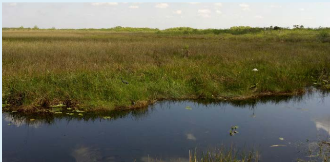
Sea level rise poses a particular risk for the Everglades—a vast, ecologically rich area, much of which is within a few feet of sea level.

The Everglades are vulnerable to both changing climate and rising sea level. Human activities have impaired this ecosystem by diverting the natural flow of water away from the Everglades to prevent flooding or to supply farmers and municipalities with